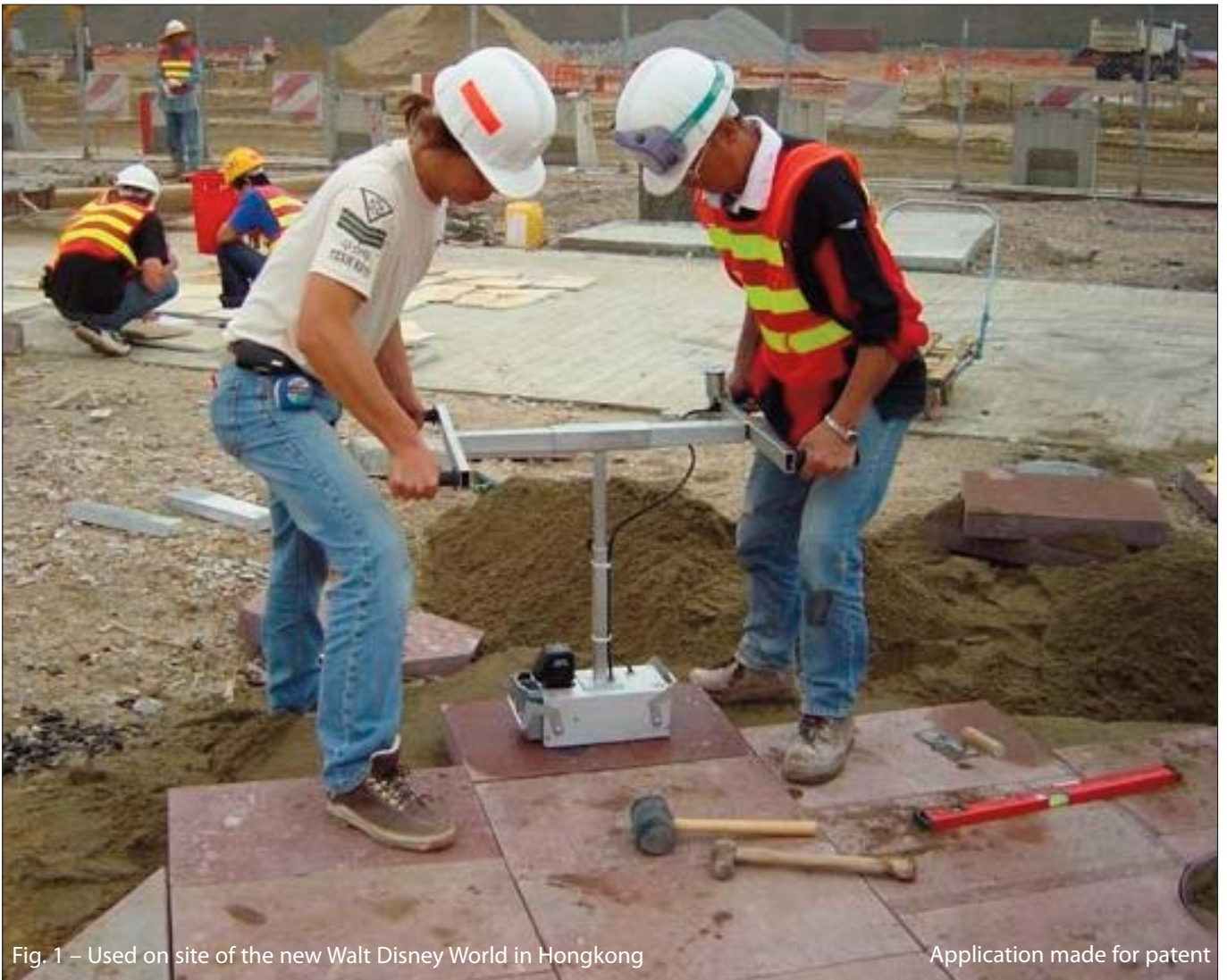
Fig. 1 – Used on site of the new Walt Disney World in Hongkong